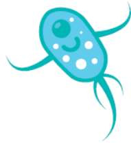
Bugs from animal wastes